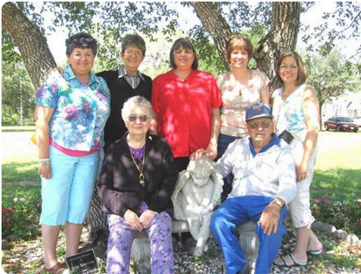
Painted Churches Tour