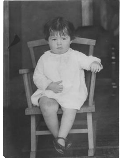
1 Yr old